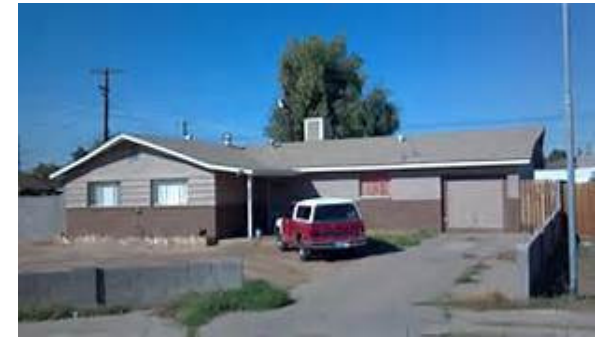
Parking on un-surfaced areas is illegal